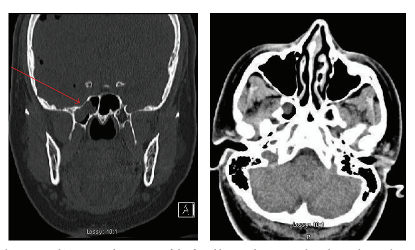
FIGURE 2: Axial and coronal Computed Tomography images of the facial bones showing right sphenoid sinus bony defect and CSF collection.

CT scan of the brain showed moderate amount of extraaxial air within the right cerebral hemisphere indicative of pneumocephalus as shown in Figure 1. CT scan of facial bones showed focal bony defect along thin roof of right sphenoid sinus with abnormal CSF collection immediately above and within the lateral recess of the right sphenoid sinus (Figure 2). Metastatic disease was ruled out with a negative bone scan and unremarkable CT scans of the chest, abdomen, and pelvis.