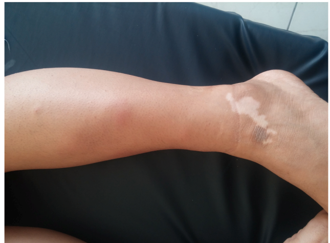
Figure 2. Erythema nodosum-like eruptions and depigmented patches on the lateral malleolus.

A diagnosis of BD was made according to the International Criteria for Behçets Disease (ICBD) 5 and vitiligo was diagnosed based