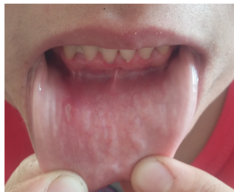
Figure 3. An aphthous ulcer on the lower lip mucosa.