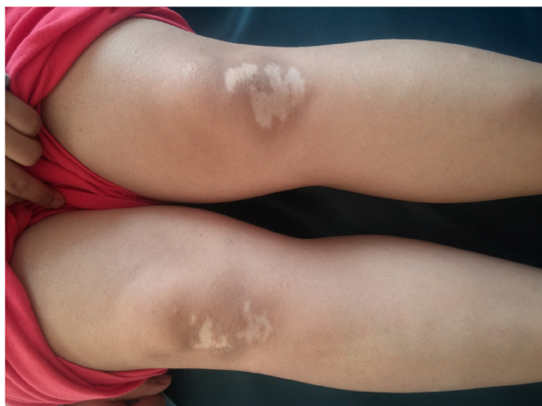
Figure 1. Depigmented patches on the bilateral knees.