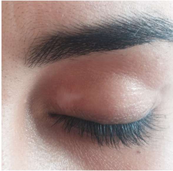
Figure 4. A depigmented patch on the upper eyelid.

on prior physical examination. Diagnosis of BD, according to the ICBBD, was based on only clinical features, but not any laboratory finding. For the ICBBD, ocular lesions, oral aphthosis and genital aphthosis are each assigned 2 points, while skin lesions, central nervous system involvement and vascular manifestations are assigned 1 point each. The pathergy test was assigned 1 point. A patient scoring 4 points is classified as having BD. Our patient had 5 points: 2 for oral aphthosis, 1 for erythema nodosum and 1 for thrombophlebitis. Additionally, laboratory results mentioned above showed an iron deficiency anemia.