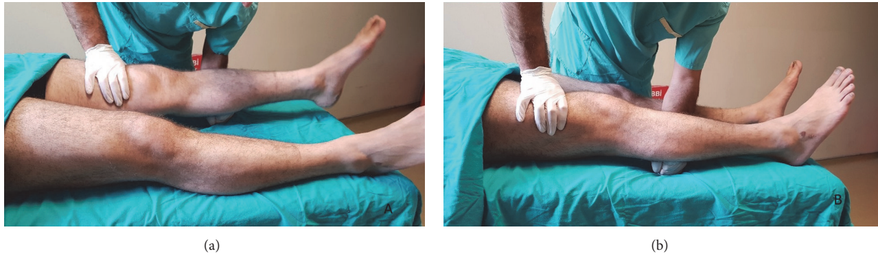
FIGURE 1: The view of the intact ACL (a) and ACL injury (b) side.

2018. All tests were independently performed bilaterally and by two senior orthopaedic specialists. The patients were reexamined until a consensus occurred in the case of a disagreement between the examiners. An audible pop at the time of injury, immediate swelling or hemarthrosis, feeling of instability and subluxation episodes are considered to be possible signs of ACL injury. The examination results were recorded and patients were followed up to evaluate the results of MRI and any later possible surgical procedures.