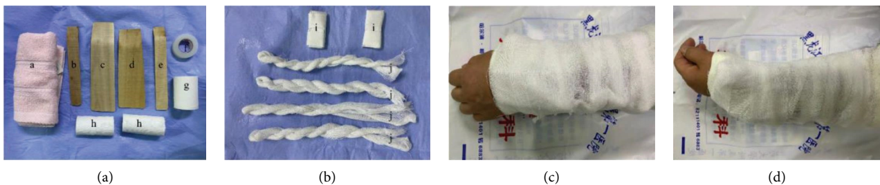
FIGURE 2: Composition and application of the traditional bamboo curtain splint in the control group. (a) Traditional bamboo curtain splint requires spare dispersing components; (b) traditional bamboo curtain splint requires improvised components; (c) dorsal view of the Colles fracture of the left wrist with a traditional bamboo curtain splint; (d) lateral view of the Colles fracture of the left wrist with a traditional bamboo curtain splint; (A) cotton liner; (B) ulnar side splint; (C) dorsal side splint; (D) volar side splint; (E) radial side splint; (F) adhesive tape for the skin; (G) adhesive plaster; (H) bandages; (I) two pressure pads; (J) four cotton tapes.

3 rd , and 5 th weeks, the fixation of the integrated retainer pad splint was more stable, and the reduction loss was less during the treatment. In Gartland–Werley wrist function at the 8 th week of treatment, the rate of good results with the integrated retainer pad splint was higher than the traditional bamboo curtain splint for the distal radius.