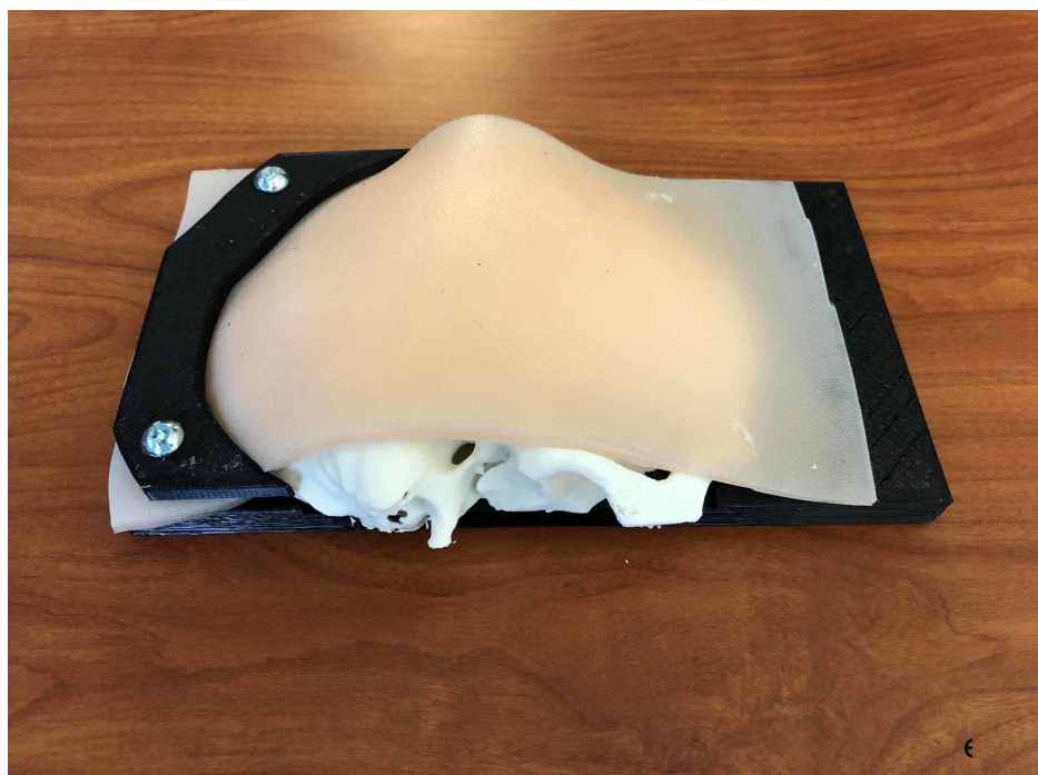
FIGURE 3: Intact craniotomy simulator