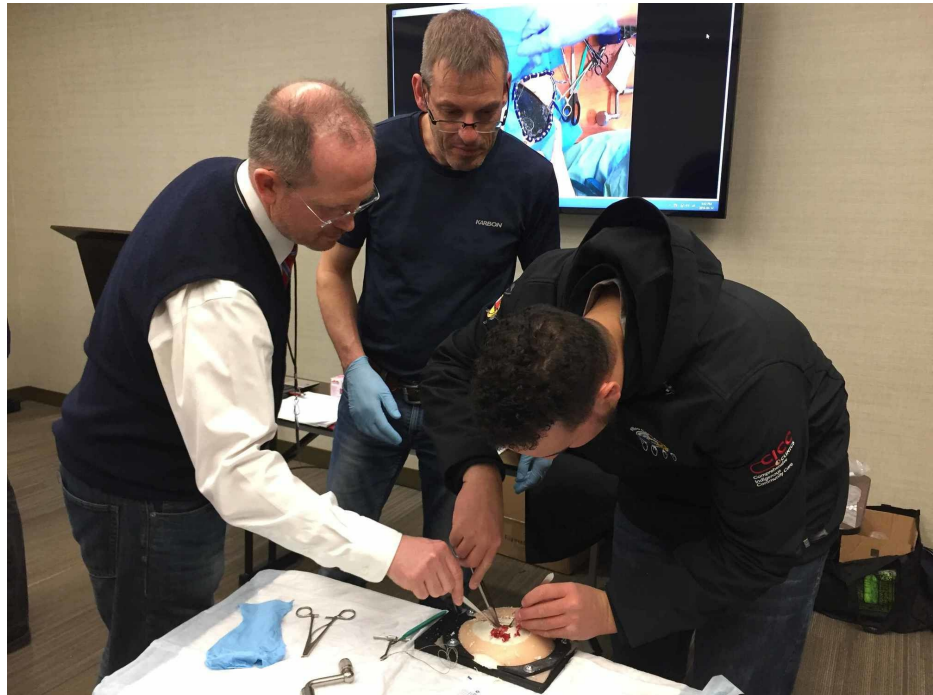
FIGURE 6: The 3D model being used for training purposes at the Society of Rural Physicians of Canada Conference in St. John's, Newfoundland (April 2018)

graded on a five-point scale. Previous research has shown that this GRS is reliable and a valid assessment of technical skills both in the operating room and in the simulated operation [15]. If various levels of residents and experts try it and are graded using the GRS and the experts do very well and the residents not so well, it could have validity. The skull simulator was used at The 2018 Society of Rural Physicians of Canada Rural and Remote conference with great feedback (Figure 6). The main weakness of this simulation is that it is near impossible to test whether or not actually the simulation helps learners become more competent at the procedure as its occurrence is so rare, there is no way to quantify outcomes because of this training. However, if the simulation was tested by physicians with experience performing the procedure for realism (neurosurgeons or other), consistency, accuracy and reproducibility, that would be a good start as without the simulation, general surgeons will likely have no hands-on experience of the procedure before they may have to complete it in an emergency situation.