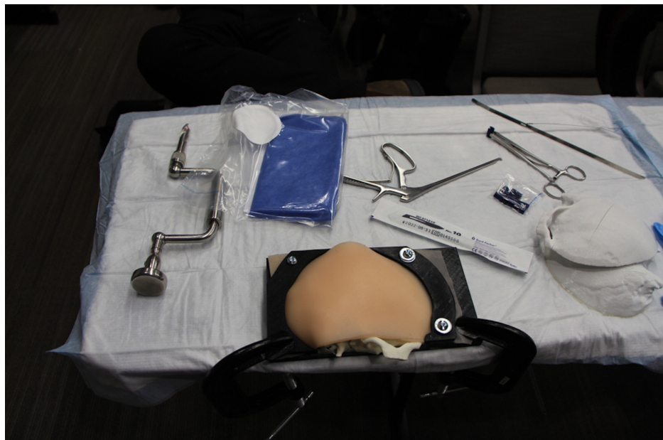
FIGURE 5: The craniotomy simulator and sample instruments for evacuation