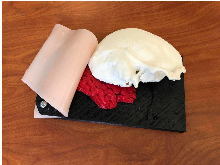
FIGURE 4: The craniotomy simulator with “skin” removed to show all three layers.