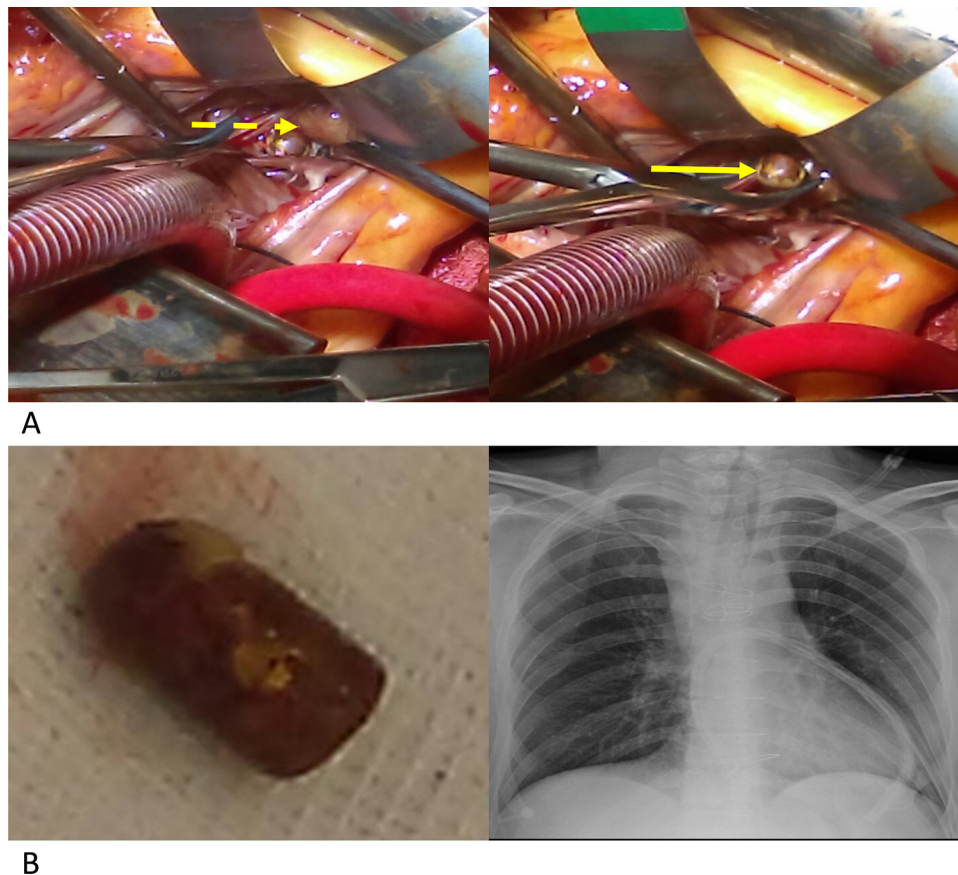
Fig. 3. (A) Bullet (yellow arrow) extraction from ventricular septum (yellow dashed arrow). (B) Projectile 20 × 10 mm. (C) Chest X ray after surgical procedure.

Because of the high risk for pulmonary embolization, surgical exploration was planned. An sternotomy was performed by a cardiothoracic surgeon, the patient was submitted to extracorporeal circulation, the projectile was identified in the ventricular septum and it was extracted through an incision in the right atrium without presenting any complication associated to the procedure. The projectile measured 20 × 10 mm (Fig. 3).