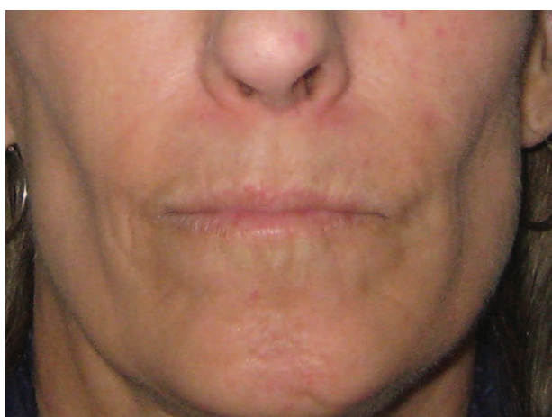
Fig. 2. The same patient at 6 months (M6) of the reinjection of 16 ml of adipose tissue on the face.