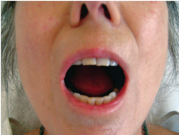
Fig. 5. A 60-year-old patient with a diffuse cutaneous form of the disease when opening the mouth before surgery (M0).