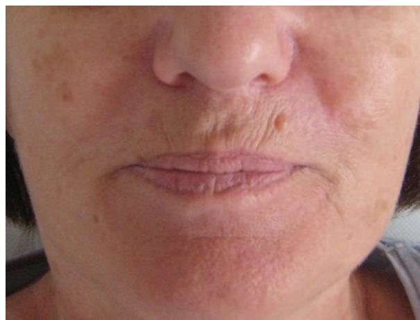
Fig. 3. A 67-year-old patient with a limited cutaneous form before (M0) surgery.