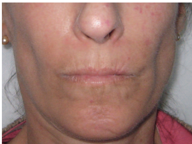
Fig. 1. A 58-year-old patient with a diffuse cutaneous form of systemic sclerosis before (M0) surgery.