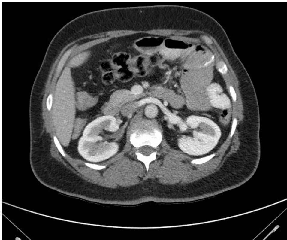
Fig. 1. Contrast CT-scan at the presumed level of the fish bone showing dilated intestinal loops..

evidence of active peptic ulcer disease (PUD). A trial therapy of high dose proton pump inhibitor's (PPI's) did not provide relief.