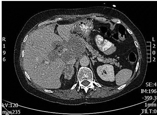
Fig. 1. CT scan image showing a mass of 8 × 5 cm in the hilar area of the liver, involving the pancreas head and encasing regional blood vessels.