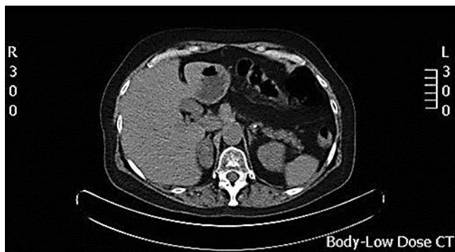
Fig. 2. PET-CT scan image showing partial response after 6 cycles of cisplatin-etoposide chemotherapy. The smaller size of the tumor (2 × 3 cm) and its epigastric and preaortic localization makes surgical treatment feasible.