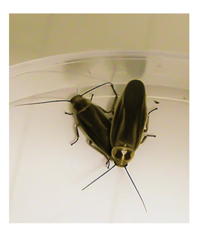
Figure 1. Male (left) and female (right) Schultesia nitor.

copulation (e.g., N. cinerea ; Roth 1962, 1964a). Monandry can also arise from abiotic constraints. In Pieris napi for instance, females exhibit two mating strategies: they can either be polyandrous or monandrous. Although these differences are under genetic control (Wedell et al. 2002b), monandry in this species has been shown to be selected in populations facing unfavorable weather conditions (Välimäki et al. 2006).