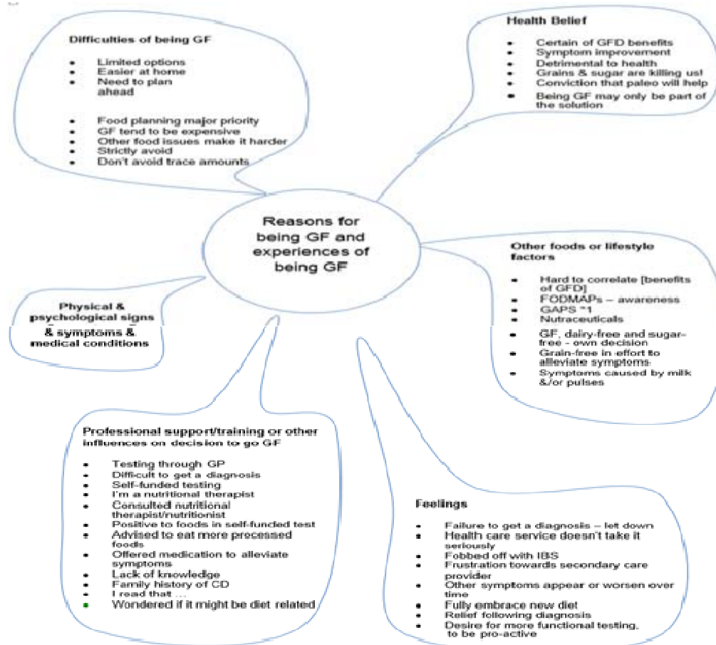
Figure 1. Thematic map; Summary of the themes from the data analysis