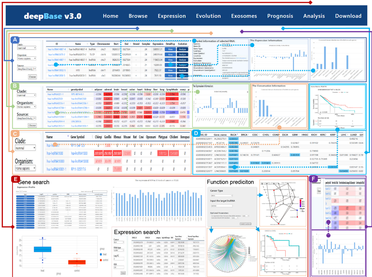
Figure 2. Introduction and usage of deepBase v3.0. (A) Browse page for ncRNAs with its detailed information, expression, and evolutionary conservation pages. (B) Expression page for ncRNAs with a detailed expression profile. (C) Evolutionary conservation of lncRNAs across 14 species. (D) Prognosis associated with cancer-related ncRNAs and detailed pages containing KM-plots of corresponding ncRNAs. (E) Multiple analysis interfaces for gene, expression, and function predictions. (F) Exosome expression page and detailed information for exosome expression profiles.

The gene search page shows the detailed expression of a single RNA in different types of cancer. This page consists of four parts. The left search bar includes the input box and guide. In the right section, a data table shows the expression and related information, and a boxplot shows the specific expression in one cancer type. Users can click on the cancer name in the data table to change it. A bar plot shows the cancer-wide expression. This page was designed to give users a direct and quick access to specific RNA information.