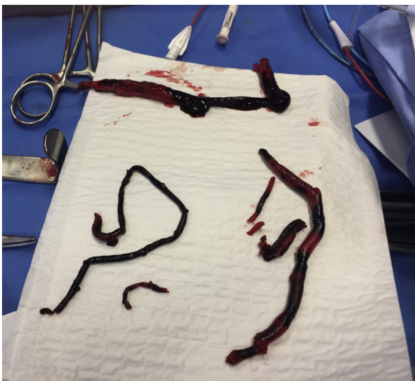
Fig 4. Thrombus extracted from the iliac and popliteal left arteries.

Indication for a third CT scan was retained because of deterioration of the hemodynamic state. Aortoiliac kissing stents and right popliteal artery were observed to be patent, but a recent small renal infarction with no evidence of renal thrombus was present on the right side. No other site of embolization was identified. A left transtibial amputation was undertaken after hemodynamic stabilization.