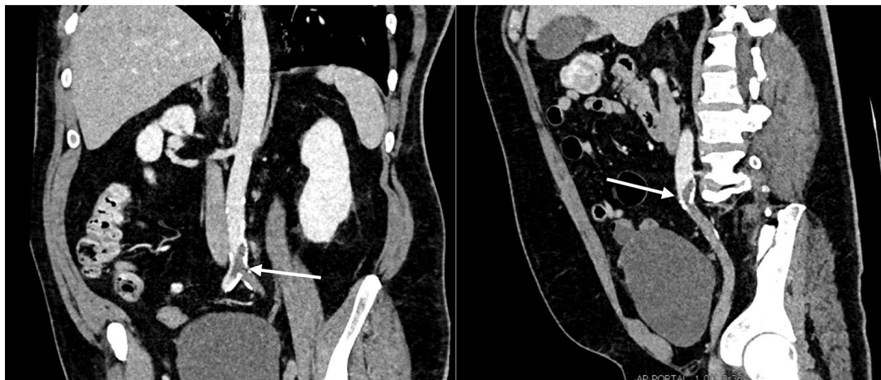
Fig 1. Infrarenal distal aortic and left iliac artery thrombotic occlusion on preoperative computed tomography (CT) scan ( white arrows ).