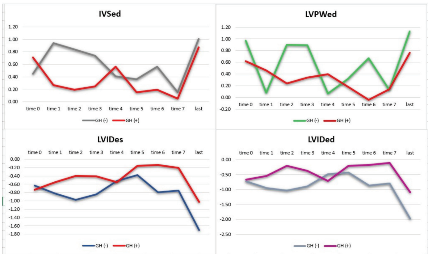
Figure 3. Z score of echocardiography parameters in all groups during follow-up

There are several studies investigating the effect of rGH in NS cases (Table 1). Brown et al. (13) showed that HCMP did not develop in the follow-up. The effect of rGH could not be clarified in cases with HCMP, since they were excluded from the study (6). Seo and Yoo (14) showed that rGH was not a risk for HCMP progression and tumor development (24). Of the six articles evaluating adult height in NS patients receiving rGH (n = 889), cardiac adverse events were described in only five patients, including two mild PS progression, one HCMP, one increased biventricular hypertrophy, and one cardiac decompensation (25). Noordam et al. (16) evaluated left ventricular thickness in 27 patients with NS. Mild, non-progressive HCMP was detected in one. Patients were divided into group A (rhGH was started immediately and stopped for two years) and