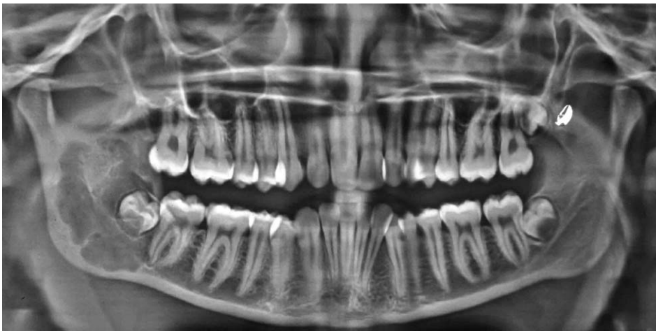
Fig. 1. A panoramic radiograph shows a well-defined multiloculated radiolucent lesion extending from the distal border and apex of lower right second molar into the ramus till approximately 3 mm away from the sigmoid notch enclosing the developing tooth bud of right lower third molar.

A cone-beam computed tomographic (CBCT) scan was obtained using a Kodak 9000 3D machine (Carestream Health Inc., Rochester, NY, USA), with a field-of-view (FOV) of 50 mm × 37 mm, voxel size of 76.5 μm × 76.5 μm × 76.5 μm, and exposure time of 10.8 s. The captured images were reconstructed using a high-spatial-frequency reconstruction algorithm, and these images revealed a well-defined multiloculated radiolucent lesion in the right mandibular ramal region (Figs. 2A and B). This lesion extended from the right lower second molar to the upper third of the ramus, with resorption of the apex of the right mandibular