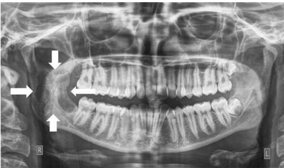
Fig. 4. A panoramic radiograph shows healing of the surgical defect by new bone formation 3 months post-surgery (white arrow heads).

As stated previously in the Introduction section, a case of GOC, an unusual odontogenic developmental cyst of the jaws, is presented herein. In accordance with previous studies and cases, our case demonstrated significant mandibular involvement. 7 In addition, the radiological features showed similarities with previous reports, including a well-defined radiolucency with distinct borders along with loss of cortical integrity and root resorption.