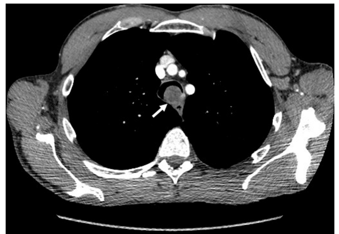
Fig. 3. Chest computed tomography scan with contrast showing a hypodense round lesion within the trachea with areas of fatty attenuation and peripheral enhancement (arrow).

On flexible bronchoscopy there was a polypoid lesion on a small stalk on the tracheal wall about 5 cm distal to the vocal cords. The lesion was soft and encompassed about 80% of the lumen (Fig. 4a). There were no other endobronchial lesions. Following initial visualization, we placed the suspension laryngoscopy and a flexible bronchoscope in the airway again to snare the lesion. It was about 2 cm, appeared slightly vascular, and on palpation felt slightly calcified (Fig. 4b). We replaced the bronchoscope and did not appreciate