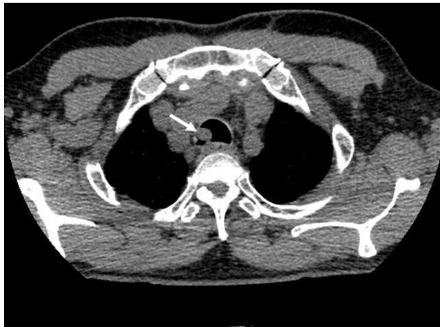
Fig. 1. Chest computed tomography scan without contrast showing polypoid endoluminal lesion in the proximal right trachea (arrow).