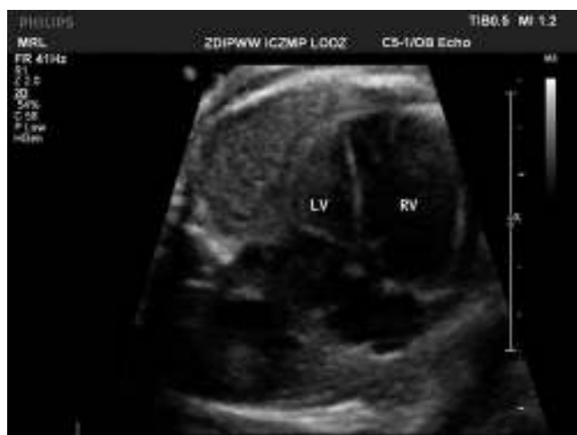
Fig. 7. The same patient at 38th weeks of gestation with cardiomegaly, abnormal heart axis, and beginning of fetal congestive heart failure which requires transplacental therapy for safe pregnancy continuation (fetal echocardiography monitoring and therapy is presented in Table VI).

Ryc. 7. Ten sam pacjent w 38 tygodniu ciąży z kardiomegalią, nieprawidłową osią serca, z objawami zaczynającej się niewydolności krążenia wymagającej terapii przezłożyskowej celem bezpiecznego kontynuowania ciąży (opis monitorowania tabela VI).