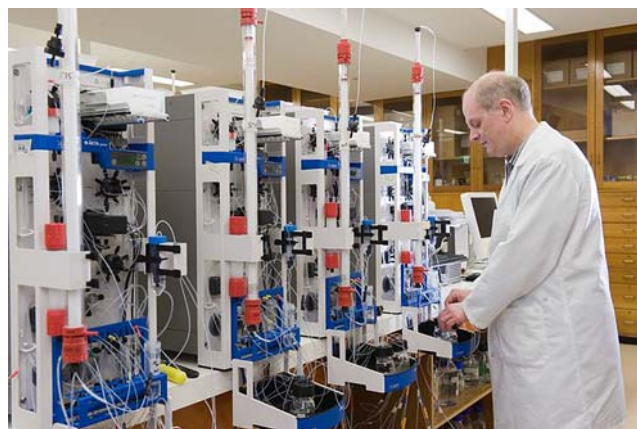
Fig. 3 Monash University, protein production facilities