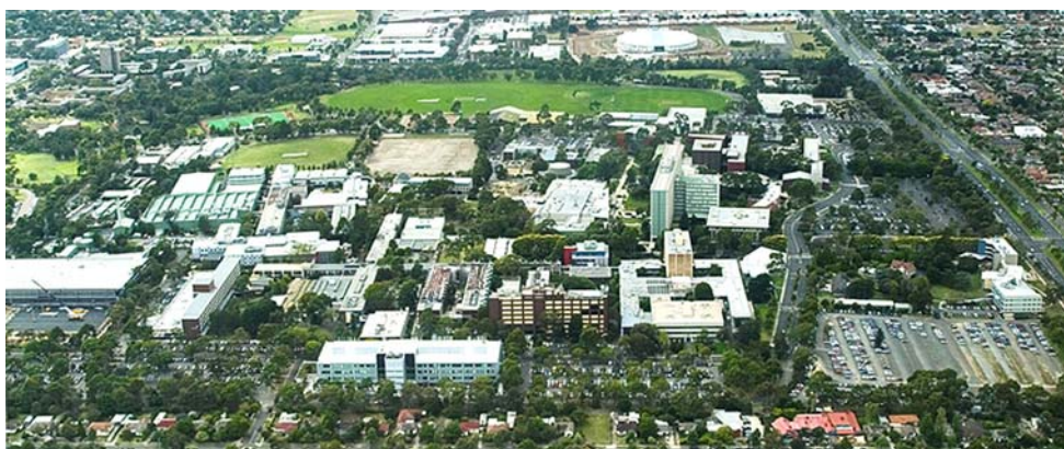
Fig. 1 Monash University, Clayton campus

and skills to suit immediate needs with little capacity to expand into broader areas of related research or to undertake even moderate scale translational research. Similarly, small-to-medium biotechnology companies require access to often sophisticated R & D technology and expertise without having to hire skilled personnel and avoiding extensive purchasing and renewal of high technology infrastructure. Both academic and industrial groups benefit from access to shared cutting edge infrastructure run by skilled operators, and which has appropriate access arrangements, high quality governance, and transparent cost structures.