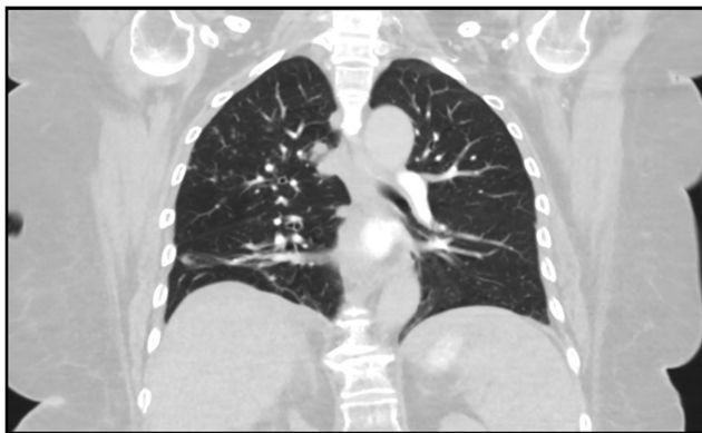
Figure 1 Bilateral scattered air space opacities demonstrated on a computer-tomography pulmonary angiogram.

Three weeks after her presentation, she was noted to have elevated corrected calcium of 2.79 mmol/L (2.10–2.60). Her calcium concentrations were observed and continued to rise steadily. The patient was surprisingly asymptomatic from the hypercalcaemia. She remained alert and oriented and did not experience polyuria or polydipsia. Throughout her hospitalisation she remained ambulant, mobile and had consumed a regular diet without any nutritional or calcium supplementation.