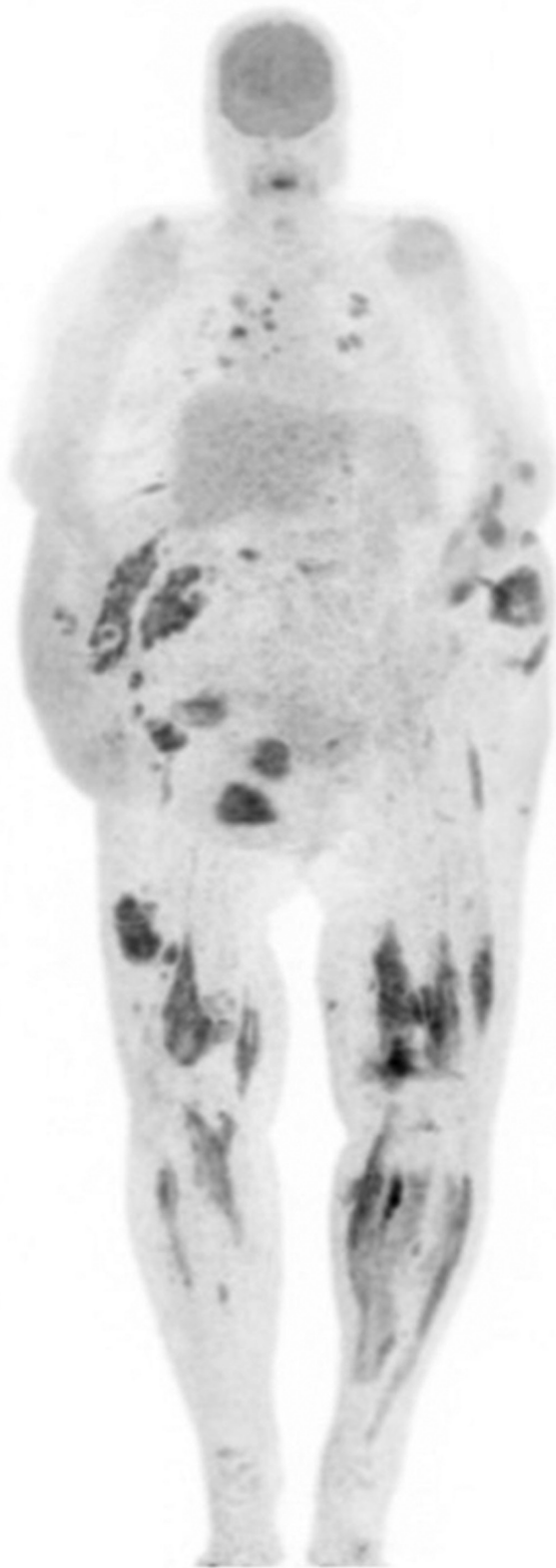
Figure 3 FDG-PET demonstrating FDG-avid lesions in s.c. and muscle tissues of forearms, lower torso and lower limbs, and FDG-avid pulmonary nodules and right hilar lymphadenopathy.