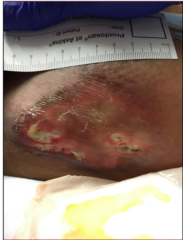
Figure 2 Cutaneous cryptococcosis with ulcerated pustular lesions.