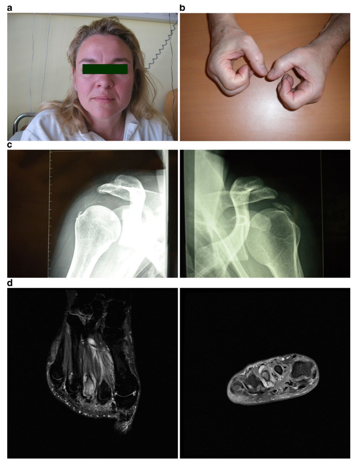
Fig. 2 a , Chikungunya infection, acute stage with edematous rash of the face. b , Chikungunya infection, chronic stage with swollen and stiff hands in a 55-year-old man who was infected 5 years earlier. c , Chikungunya infection, chronic stage with bilateral calcifications of