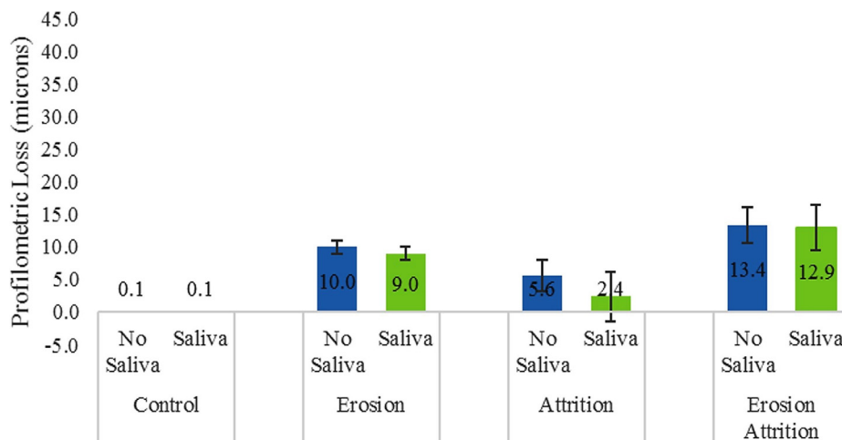
Fig. 2 Enamel Profilometric Step Height Loss (in microns).