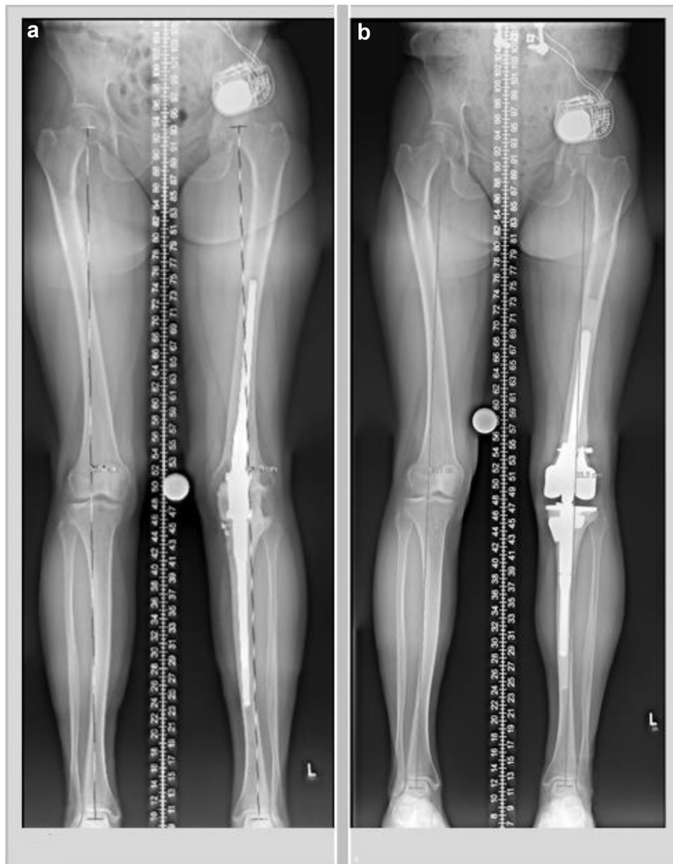
Figure 1. Conversion of an intramedullary knee arthrodesis (a) back to arthroplasty using a rotating hinge prosthesis (b).

The diagnosis and treatment algorithm is based on the recommendations of the PRO-IMPLANT Foundation [16,17]. It is built on a