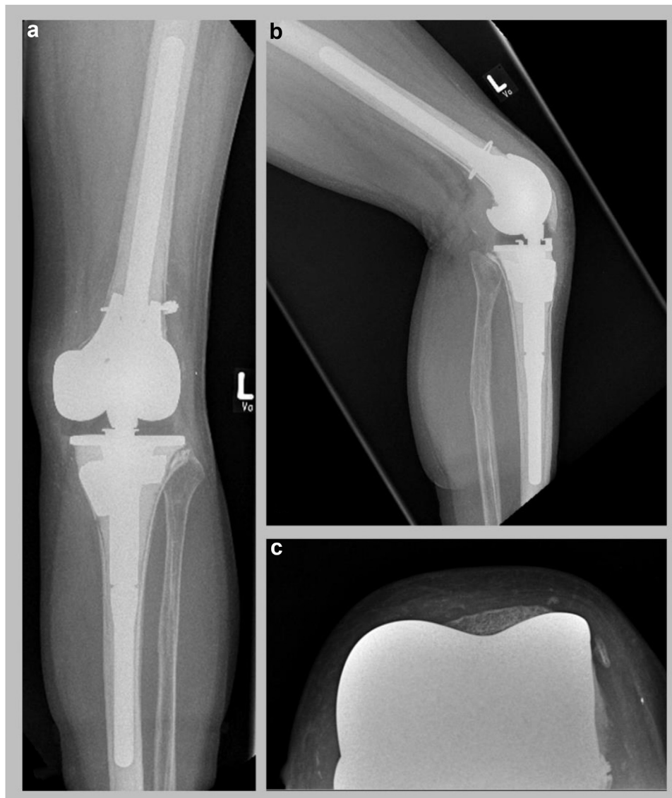
Figure 4. NexGen RH Knee (Zimmer Biomet, Warsaw, IN) in (a)anteroposterior, (b) lateral, and (c) tangential views of the patella.

The patient presented in the outpatient clinic after 3, 6, and 12 months and annually thereafter. At the 3-year follow-up, successful infection eradication was verified because of the Delphi-based consensus definition by Diaz-Ledezma et al. [21]: (1) healed