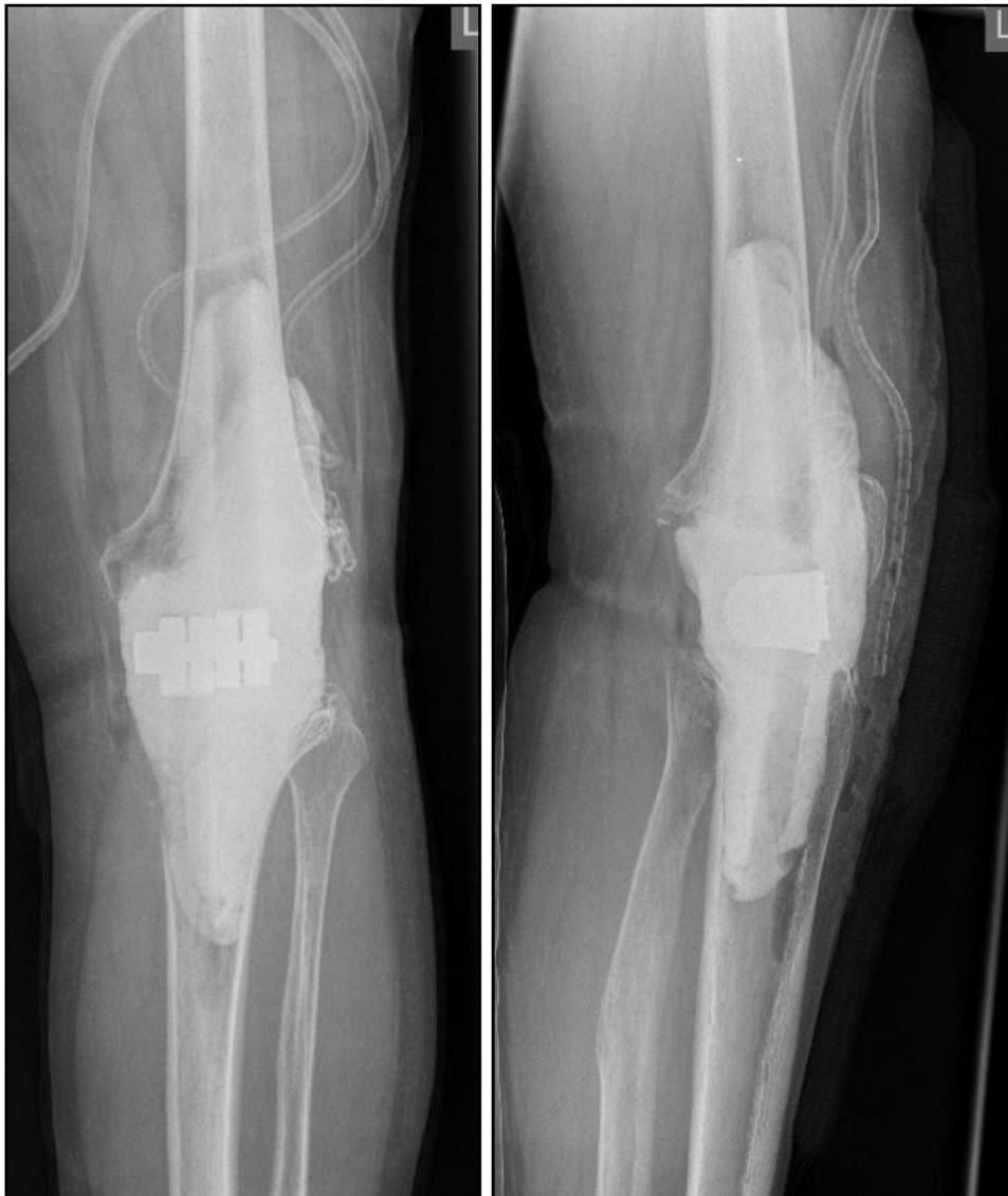
Figure 3. Poly(methyl methacrylate) spacer with carbon rods and a tube-to-tube connector.

was conducted. In addition, evaluation of the extensor mechanism must be an integral part of the initial operation to develop a precise planning of the further treatment. First, the cemented arthrodesis was explanted followed by a radical debridement with removal of all foreign material, cement remnants, and infected tissue. The