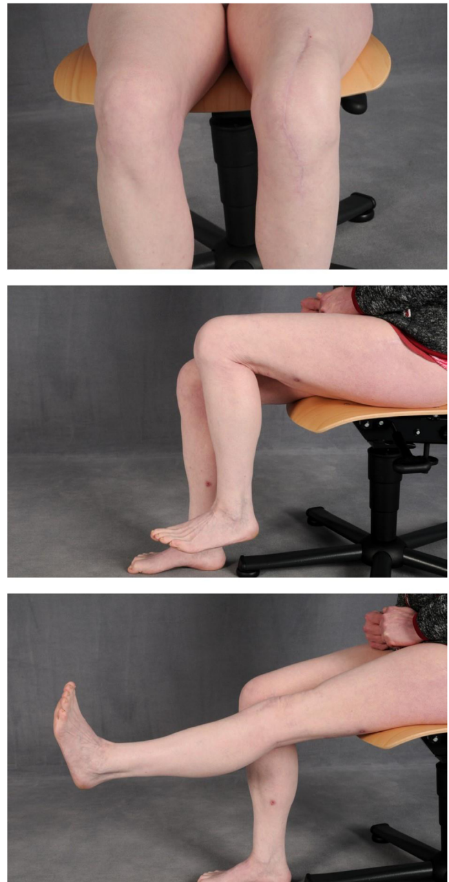
Figure 6. Patient at 3-y follow-up, knee in anteroposterior position.; extension 0° and flexion 100° in the lateral position.

Schoof et al. [26] reported heterogeneity in the treatment of fPJIs of the hip. Of 45 cases of fPJIs, 7 (16%) patients received a permanent resection arthroplasty. Two (4%) patients underwent one-stage exchanges and 26 (58%) 2-stage procedures. Furthermore, they noticed delayed arthrodesis in one (2%) patient, 5 (11%) debridements with retention of the prosthesis, and 4 (9%) patients were treated solely with antifungal suppression therapy. In 78% of the cases, the use of local antimycotic agents has not been reported. In 2018, Brown et al.