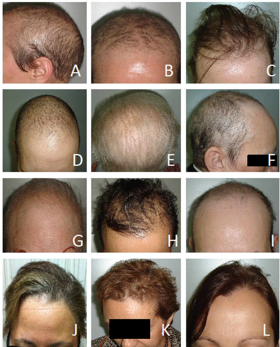
Fig. 2 Persistent alopecia after 46 to 120 months following the conclusion of docetaxel chemotherapy. Panels a–i: Grade 2 Persistent Alopecia. Panels j–l: Grade 1 Persistent Alopecia (with permission from the patients)

One hundred and twenty patients received docetaxel CD \geq 400 \text{ mg/m}^2 and were considered evaluable for study purposes. The remaining patients did not reach the threshold docetaxel dose due to docetaxel interruption (6 patients) or dose reductions (10 patients).