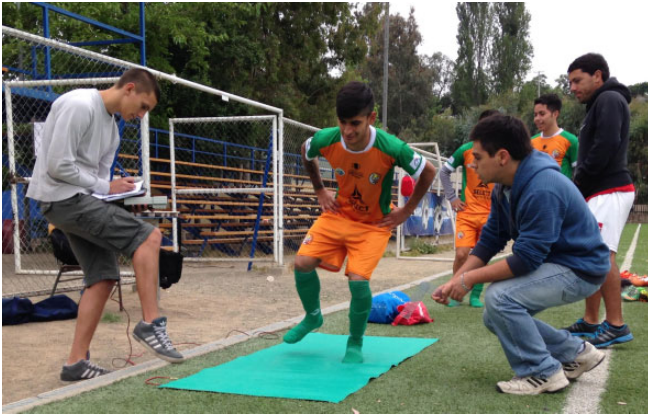
Figure 1. Modified single-leg squat jump test. A soccer player is set in position for a vertical jump on top of a switch mat (Ergo Tester; Globus), with the research team ready to record the data. The researcher on the right is certifying proper position of the athlete prior to the jump: single-leg semi-squatting position with 90° of knee flexion (measured with a standard goniometer) and both hands placed on each ipsilateral iliac crest.