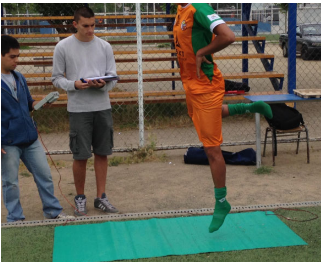
Figure 2. Modified single-leg squat jump test. The soccer player performs a vertical jump with maximal knee and ankle extension, trying to reach as high as possible, with both hands kept over the iliac crests. The mat registers the jump height in order to calculate the athlete's muscle power.

was repeated 3 times with each extremity, and the best jump was considered for statistical analysis.