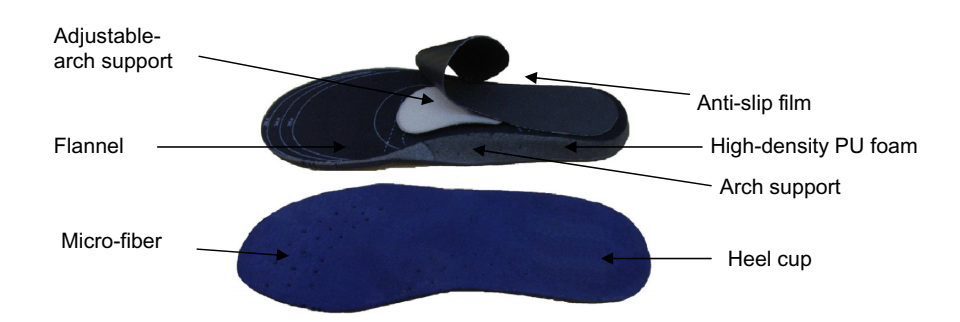
Figure I The heel cup was made up of a high-density polyurethane (PU) customized insole with an arch support insole for the participants. The adjustable sandwich insole is constructed with super-thin Velcro. It is a single modualized custom-made insole with adjustable inserts. The microfiber or natural leather layer is wear-resistant and moisture wicking, which keeps feet dry and comfortable. The high-density breathable PU layer is designed for long-term use without deformation and protects the foot by dampening shocks.

reliable balance index can be easily obtained; thus, the system was suitable for large sampling measurements and balance evaluation in specific people.