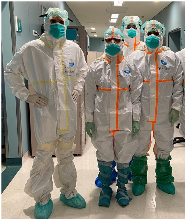
Fig. 2. Photographs of our personal protective equipment (PPE)

#: Percentage, PPE: Personal protective equipment