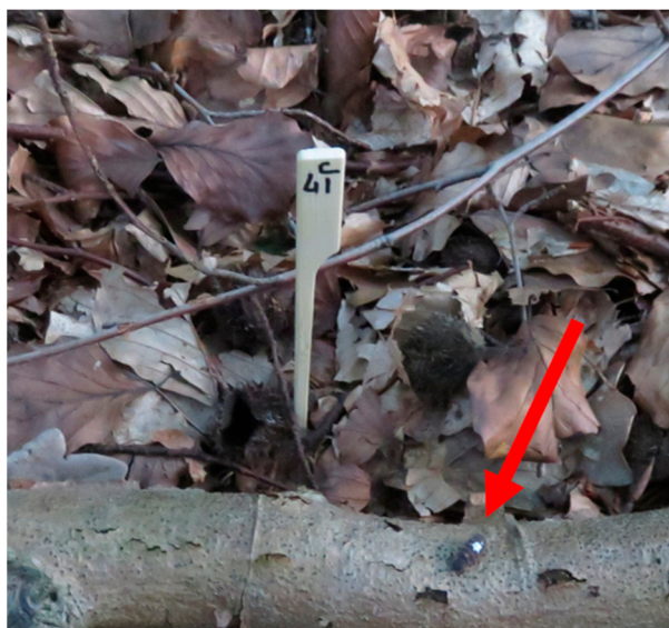
Figure A1. Marked female in the field next to a wooden stick with individual marking.