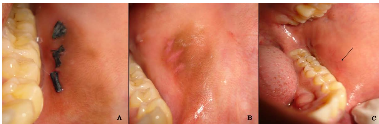
Figure 3 Follow-up of lesion after 1 week (A), after 2 weeks (B) and complete resolution after 2 months (C).

reported (Table 1). Clinically, the lesion is a flat or slightly raised black or brown macule and may rapidly increase in size, ranging from a few millimeters to several centimeters [1,12,13]. The lesions are usually solitary and well circumscribed though a few authors have reported bilateral or multiple (Table 1) melanoacanthomas. Oral melanoacanthomas are usually asymptomatic and are not neoplastic. The other lesions to be considered in the differential diagnosis are smoker's melanosis, drug induced pigmentation, Addison's disease, melanotic macule, pigmented nevi – junctional, intramucosal, compound, Spitz nevus, postinflammatory melanosis and oral melanoma. A biopsy is mandatory to rule out melanoma and to alleviate patient apprehension. Histologically, melanocytes which are usually restricted to the basal layer are found distributed throughout the epithelium. These melanocytes exhibit prominent dendritic processes and are immunoreactive for S-100, Melan-A/Mart-1, HMB-45 and Tyrosinase [14]. Other dendritic cells in the oral mucosa are the Langerhans' cells which are antigen presenting cells of the immune system, usually distributed in the superficial epithelium and are demonstrated on immunohistochemistry