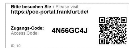
Fig. 1 ▲ Link for the complete set of High Infectious Diseases Forms (HID Forms) on Lufthansa aircraft from Lufthansa Technik AG. The forms may be used for your own purposes. Lufthansa would appreciate a short feedback (e-mail FRAPXO@DLH.DE) if you use the SOPs

In case of a suspicious or confirmed passenger suffering a highly infectious disease (HID), a special, additional disinfection of the aircraft is mandatory. For this purpose, all used disinfectants must be aircraft component compatible, i. e., must not have any negative effects on individual parts or the structure of the aircraft, while also fulfilling national healthcare requirements [13, 14]. When choosing a disinfectant, it must be ascertained that their application will cause neither short- nor long-term damage to – the aircraft structure (i.e., corrosion), – electronics and avionics (i.e., insulation of cables), – sensors (i.e., smoke detection), – interior (i.e., installations, seats, monitors, media devices, windows, galleys, countertops, restrooms).