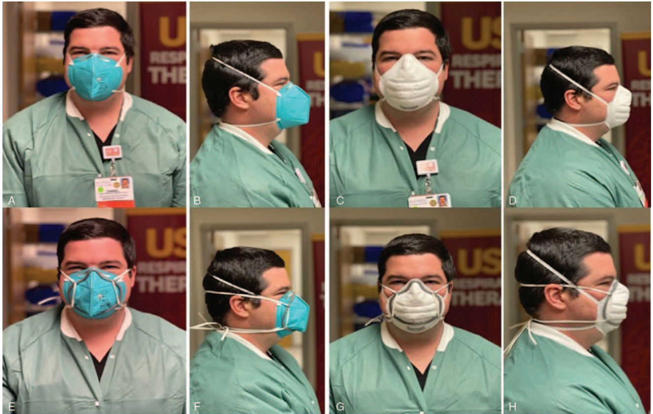
FIGURE 2. One of the authors wearing the DE2322 39.07 without (A and B) and with (E and F) the fit improving frame (FIF) and the DC300N95 without (C and D) and with (G and H) the FIF.