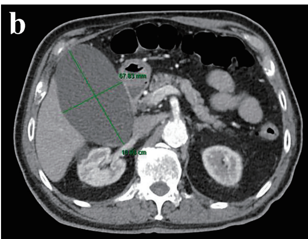
Figure 1. Coronal (a) and axial view (b) of a contrast-enhanced abdominal CT scan showing an acalculous hydropic gallbladder. CT: computed tomography.

In the emergency room, the patient was afebrile and did not meet sepsis criteria. Laboratory findings including lactate, amylase, lipase and hepatic function panel were all unremarkable. He underwent computed tomography (CT) of the abdomen with intravenous (IV) contrast, which incidentally demonstrated a hydropic gallbladder measuring 6.7 × 11 cm without evidence of cholecystitis. There was no evidence of hepatic biliary ductal dilation, and common bile duct measured 0.5 cm (Fig. 1). Subsequently, a right upper quadrant ultrasound of