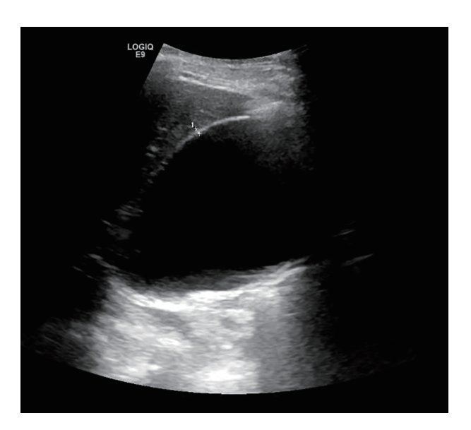
Figure 2. Ultrasound imaging of an acalculous hydropic gallbladder with demonstration of gallbladder sludge and without evidence of gallbladder wall thickening or pericholecystic fluid.

In the emergency room, the patient was afebrile and did not meet sepsis criteria. Laboratory findings including lactate, amylase, lipase and hepatic function panel were all unremarkable. He underwent computed tomography (CT) of the abdomen with intravenous (IV) contrast, which incidentally demonstrated a hydropic gallbladder measuring 6.7 × 11 cm without evidence of cholecystitis. There was no evidence of hepatic biliary ductal dilation, and common bile duct measured 0.5 cm (Fig. 1). Subsequently, a right upper quadrant ultrasound of