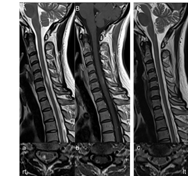
Fig. 2. Midsagittal T2-weighted image (T2WI) (1.5 T; TR 3800 ms, TE 95 ms) (A) on admission showing a high-intensity lesion, while a gadolinium-enhanced T1-weighted image (Gd T1WI) (TR 560 ms, TE 11 ms) (B) showing a faintly enhanced lesion at the C5/C6 level. Axial T2WI (TR 4000 ms, TE 100 ms) (a) on admission showing a high intensity and Gd T1WI (TR 430 ms, TE 12 ms) (b) showing an enhancement on the right side of the spinal cord at the C5/C6 level. Sagittal (C) (1.5 T; TR, 3800 ms, TE, 95 ms) and axial C5/C6 level. (c) T2-weighted MRI (TR, 4000 ms, TE, 100 ms) of the cervical spine one month after admission showing a decreased high-intensity lesion.

Although in our case, the onset of MS might have been triggered by the vaccination, it is impossible to decide whether this occurrence is causally linked to the vaccination or a mere coincidence. Moreover,