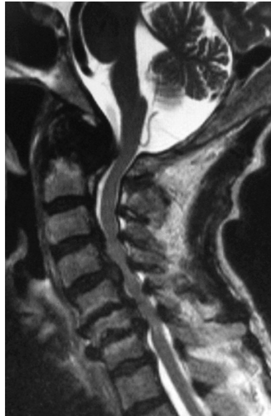
Fig. 2. Magnetic resonance imaging shows spinal canal stenosis at the upper cervical level and C3-C7.

We performed posterior Oc-C7 fixation, C1 posterior arch resection, and C3-C7 laminoplasty. A block of iliac bone graft was placed between Oc and C2. Bone graft was also placed between C3 and C7. Postoperative radi-