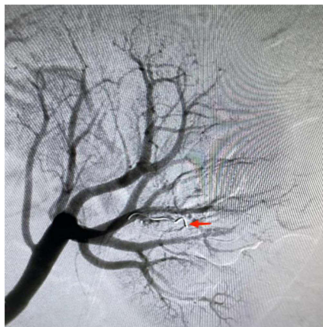
Figure 2 The first instance of SRAE showing the embolized artery with a coil (red arrow).

successfully inserted. After the procedure, the catheter produced urine that was pink in color, and the nephrostomy tube was sealed. The second day after PCNL, the patient felt bursting pain in the left renal region, and fresh blood was observed in the nephrostomy tube. The Hb (hemoglobin concentration) decreased by 33 g/L, and the patient received a transfusion of 4 units of blood. The catheter produced urine of a pale yellow color, suggesting that the bleeding had been momentarily halted. On the day following the bleeding, the catheter produced pee that contained recently released blood. Renal angiography was promptly conducted, revealing uniform staining and intact renal outlines with no signs of persistent bleeding. However, the doctor found a suspicious artery besides the nephrostomy tube. A 2*3mm coil was used to embolize the suspicious artery ( Figure 2 ). Gradually, the patient's urine turned pale yellow, and the cautious course of therapy was continued. When the bleeding returned two weeks after PCNL, emergency digital subtraction angiography was carried out. After closely examining the first arteriography data, the physician observed that the artery proximal to the nephrostomy tube, which had been embolized during the first renal angiography, was now open again. This led him to conclude that there might be a vascular involved. The intervention doctor attempted to use a coil to embolize the