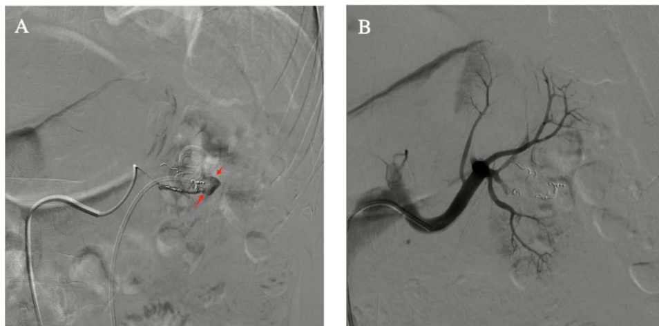
Figure 4 (A and B) DSA for the third time showing the presence of the pseudoaneurysm. (A) Showing the appearance of pseudoaneurysm (red arrows). (B) Showing the disappearance of the pseudoaneurysm after SRAE.

offending artery, but because the artery was too narrow, the coil fell into the lower polar artery. A gelatin sponge was used to embolize the offending artery (Figure 3). After the embolism, the patient still had extensive hematuria eight days later. To determine the cause of the bleeding, a general consultation was scheduled, and it was determined that laparoscopic renorrhaphy was the best option. Using a 2–0 barbed suture and a full-thickness monolayer, the puncture access site was located by laparoscopy.