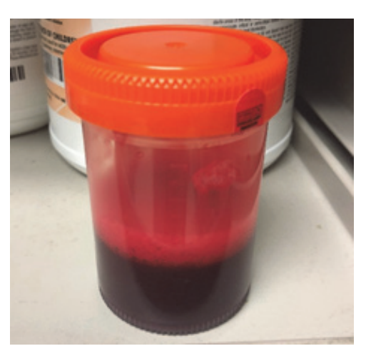
FIGURE 2: Pleural fluid sample. Of note, the whole amount of the drained fluid (1 liter) had the same color and consistency and did not clear by the end of drainage.

Apixaban was held for 48 hours and bedside ultrasound-guided thoracentesis was performed on the third day of admission. One liter of bloody fluid was drained and sent for testing (Figure 2). Pleural fluid analysis was as follows: hematocrit (Hct) 22%, red blood cells (RBC) 126,000/mm3, white blood cells (WBC) 1,400/mm3; bacterial gram-stain, culture, and acid-fast bacilli smear were negative for bacteria and tuberculosis, respectively, and cytology negative for malignant cells. Serum Hct was 25% at the time of the thoracentesis. The finding of pleural fluid analysis was consistent with hemothorax (pleural Hct to serum Hct ratio 88%). A chest computed tomography (CT) with intravenous contrast was done to rule out active bleeding, vascular malformations, and other causes of spontaneous hemothorax (Figure 3).