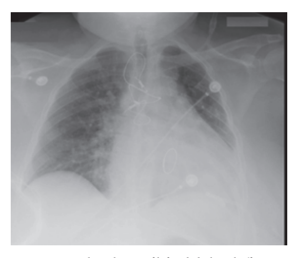
FIGURE 4: Near-total resolution of left-sided pleural effusion. Left-sided Pigtail (12-Fr) catheter and sternal wires are noted as well.

of pulmonary embolism early after starting the therapy and patients with pulmonary infarction are at higher risk of this complication [1–3, 9–12]. DOACs such as Rivaroxaban [4] and Dabigatran [5, 6] have been reported to cause spontaneous hemothorax in setting on pulmonary embolism and atrial fibrillation, respectively.