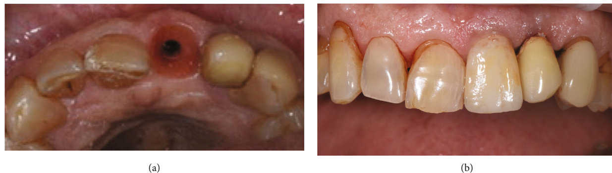
FIGURE 2: (a) Final tissue healing after 6-month follow-up. No signs of inflammation or rejection of the fragment were observed. (b) The final definitive restoration 5-year follow-up; the gingival tissues are healed and preserved.