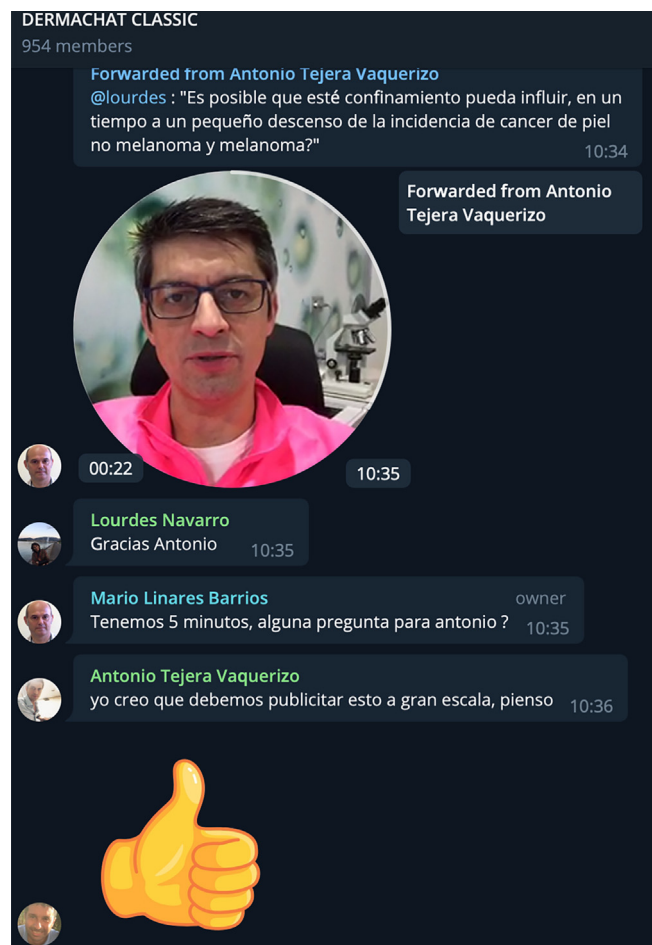
Figure 3 Chat screenshot during the debate on April 26th, 2020. The questions were formulated during the presentations the previous day, and the speakers sent their answers to the moderators beforehand, using \leq 1 -minute videos that continued one to another in smooth and efficient transitions. (Reproduced with permission.)

The opinion and future perspectives of the attendees may also be found in Table 4. All considered that this format had a bright present and future, with 17.8% of the respondents thinking that it would become a suitable replacement for the face-to-face meetings. 61.6% of the participants considered this meeting format superior to regular meetings. The respondents showed high levels of satisfaction, giving high scores to the overall conference, the speakers, and the moderators. The highest score (mean: 9.8 over 10) was given to the fact that the congress was free-of-charge. Around one-third of the participants (34.1%) would have liked some additional areas of the speciality to be covered during the meeting. Finally, 14.9% of the respondents stated that they had missed some participation of the pharmaceutical industry during the conference.