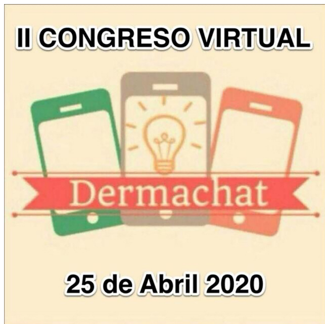
Figure 1 Congress logo.

The free tool that was chosen to broadcast the meeting was the Telegram® Messenger App (instead of using the new emerging platforms and apps for virtual meetings, such as Zoom® GoToMeeting®, Microsoft Teams®, etc.). The reason of choosing this platform was the previous existence of an ongoing professional Spanish Dermatology chat ( Dermachat ), active in Telegram since 2014. Dermachat is composed mainly by Spanish dermatologists and some European and Latin-American colleagues. It is free, with no financial support, and open to any dermatologist under some basic rules.