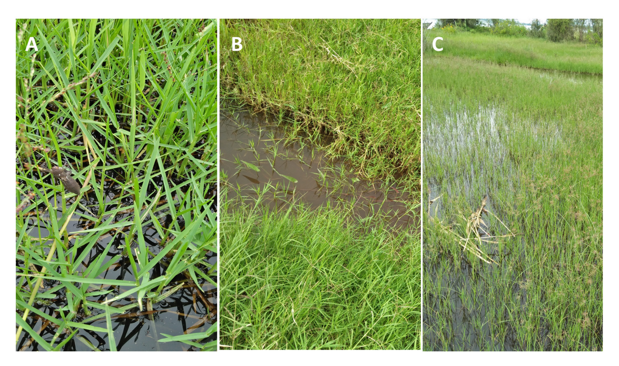
Figure 4. The most dominant graminoid plants identified during the survey. (A) Panicum repens (Poaceae), (B) Cynodon dactylon (Poaceae) and (C) Cyperus rotundus (Cyperaceae).