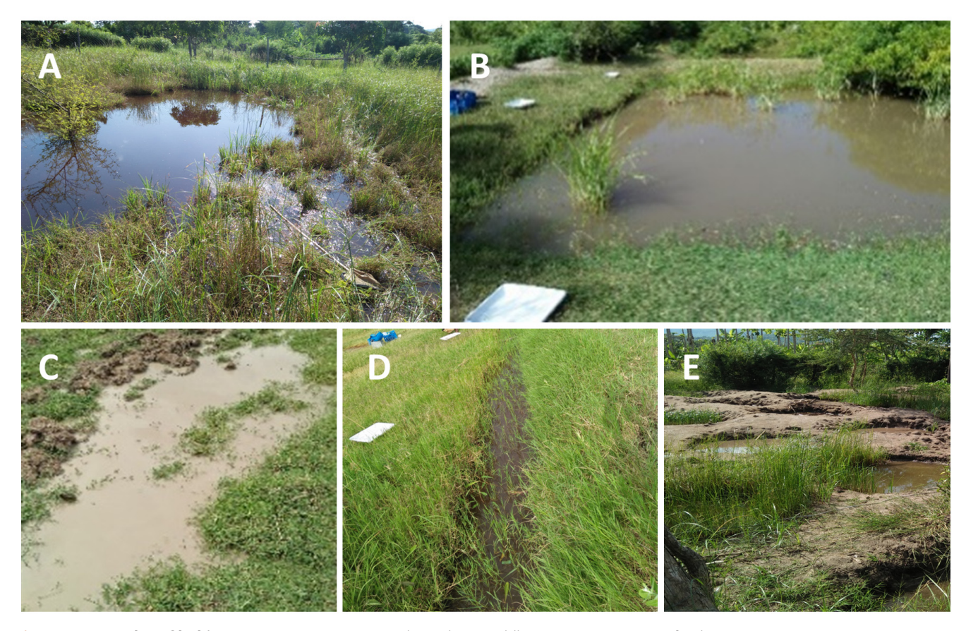
Figure 2. Examples of habitat types. (A) Swamp, (B) Fishpond, (C) Puddle, (D) Drainage, (E) Artificial pit.