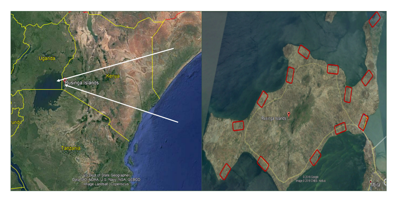
Figure 1. Map showing ( A ) Lake Victoria region, East Africa ( B ) the study clusters (rectangles in red) along the shores of Lake Victoria on Rusinga Island.