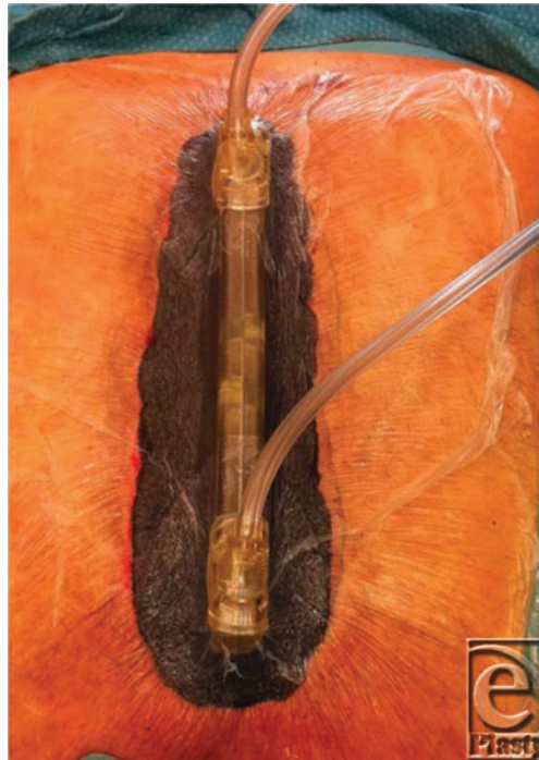
Figure 2. The HeartShield device in the sternotomy wound. The plastic drape has been applied and the drains are in place, exiting the top of the device.