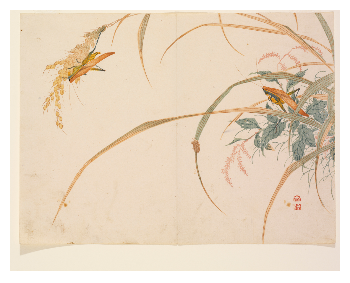
Figure 2. Grasshopper and bee, Things creeping under hand. Woodblock print by Mori Shunkei, 1820. [80].

Celebration of edible insects has also found expression in art and folklore worldwide. Two examples of this that involve edible insects found in agricultural systems include the appearance of the rice grasshopper ( Oxya spp.) in Asian art and poetry, and the role of the termite in African folklore. Asian art often expresses seasonality, and as such the seasonally available grasshopper, which is traditionally collected from agricultural fields in September, is a recognized symbol of the end of summer and beginning of autumn (Figure 2).