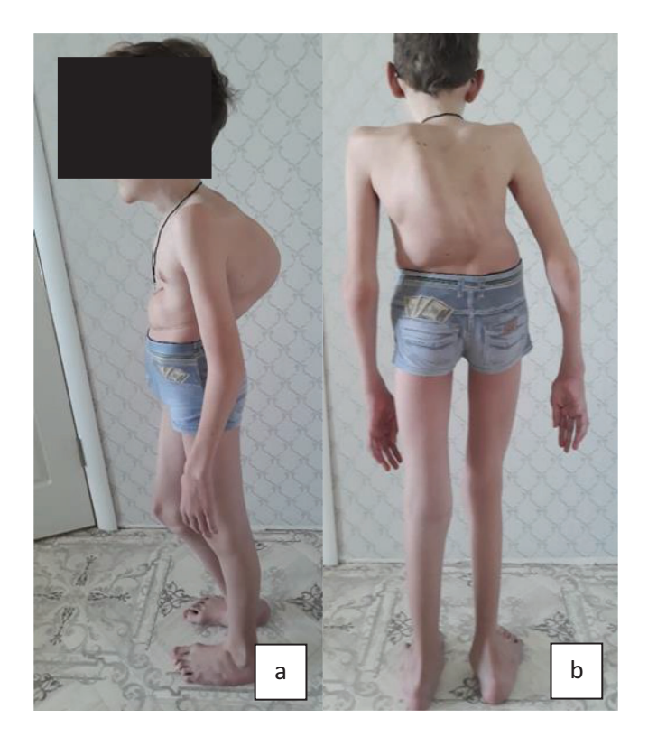
Figure 5. a) Proband no. 4: very low height and body mass (<3 percentile), thoracolumbar kyphoscoliosis of the 4<sup>th</sup> degree, pectus excavatum of the 2<sup>nd</sup> degree; b) Proband no. 4: thoracolumbar kyphoscoliosis of the 4<sup>th</sup> degree, long thin limbs, pes planovalgus .

Clinical data suggested kyphoscoliotic type Ehlers-Danlos syndrome; it was also necessary to exclude congenital muscular dystrophy. The latter was suggested based on the congenital nature of the disorder, motor development delay, absence of tendon reflexes, muscular strength decrease, Gowers' maneuvers, and electroneuromyography results. However, the slow muscular pathology progression with fast kyphoscoliosis progression (stage 4), normal CK levels, severe hypermobility syndrome (eight on the Beighton scale), and mild to moderate hearing loss called the diagnosis of primary muscular pathology into question. Molecular genetic analysis results showed a c.362dupC mutation in a homozygous state in exon 3 of the FKBP14 gene. The boy's parents had this mutation in a heterozygous state. These acquired results allowed us to confirm the EDSKS2 diagnosis.