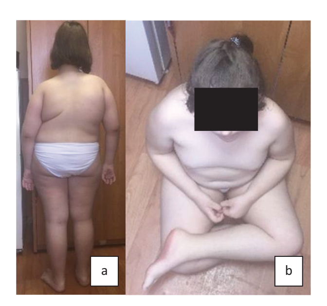
Figure 1. Proband no. 3: a) thoracolumbar dextroscoliosis of the 3<sup>rd</sup> degree; b) joint hypermobility, obesity of the 1<sup>st</sup>/2<sup>nd</sup> degree.