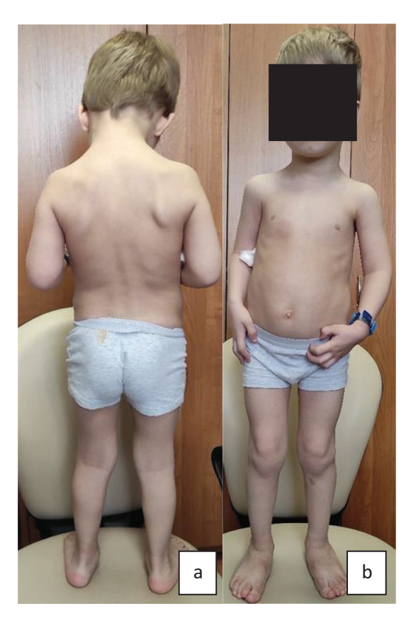
Figure 2. Proband no. 5: a) thoracolumbar levokyphoscoliosis of the 2<sup>nd</sup> degree; b) epicanthic fold, genu valgum, pes planovalgus

Figure 1. Proband no. 3: a) thoracolumbar dextroscoliosis of the 3<sup>rd</sup> degree; b) joint hypermobility, obesity of the 1<sup>st</sup>/2<sup>nd</sup> degree.