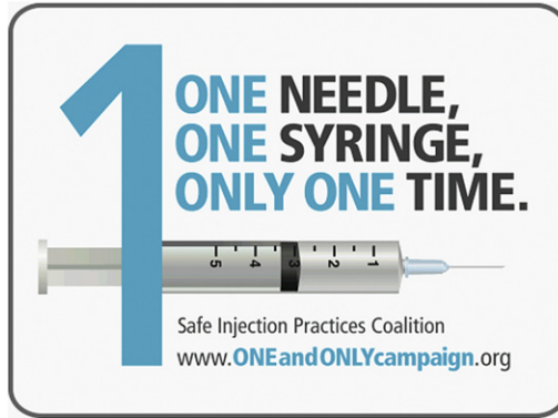
Fig. 2. Poster for safe injection practices.

are outlined in Fig. 3 . The ASA supports these practices 21 and makes further recommendations: