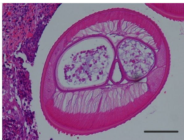
Fig. 2. Haematoxylin and eosin-stained cross-section of D. repens ; external cuticular ridges are well visible; case 1. The parasite was photographed using a microscope and DS-Fi1 camera (Nikon). Scale bar: 100 \mu m

Demographic and clinical data of the human cases. Human cases with D. repens dirofilariasis are presented in Table 2. The excised subcutaneous nodules were of soft consistency. Microscopical examination of the histological sections revealed a parasite with internal organs and thick laminated cuticle with characteristic longitudinal ridges (Fig. 2) surrounded by inflammatory reaction and granulation tissue.