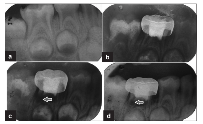
Figure 1: Preoperative and postoperative radiographs of mandibular second primary molar treated with formocresol pulpotomy revealed internal resorption and furcation radiolucency. (a) Preoperative radiograph; (b) radiograph taken 3 months postoperatively showing features of failure in pulpotomy; (c) radiograph taken 6 months postoperatively showing features of failure in pulpotomy; (d) radiograph taken 12 months postoperatively showing features of failure in pulpotomy

Children from 5 to 8 years of age were selected as per the