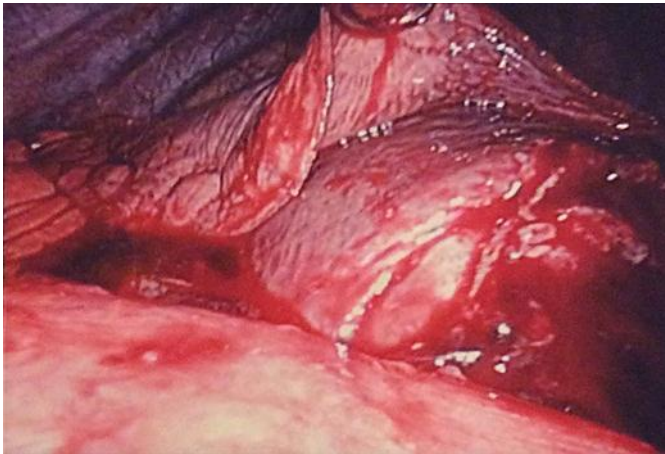
Fig. 2. Large gelatinous mass with bleeding into the pleural cavity as seen on video-assisted thoracoscopic surgery.