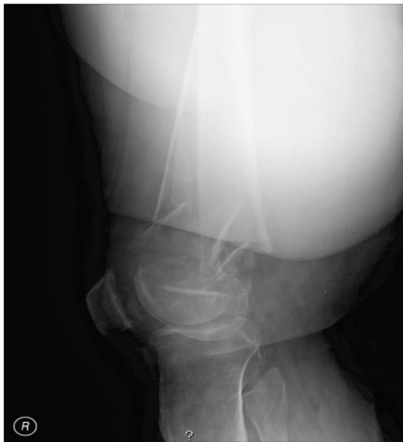
Figure 2 A-B Pretraction radiograph demonstrating distal femur fracture.

nerve distribution. However, due to the body habitus of the patient complete ligamentous evaluation of the knee was not possible either with clinical examination or magnetic resonance imaging.