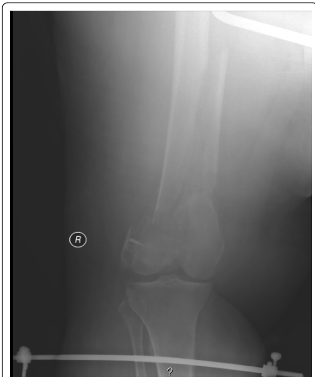
Figure 4 Posttraction radiograph of distal femur fracture with varus alignment.

manifested as pain, numbness, tingling, and in more serious cases, a loss of foot dorsiflexion and eversion. Ultimately, this can lead to decreased function of the lower limb, gait abnormalities, possible loss of ambulation, and an overall decrease in functioning [21]. Current methods of treatment of common peroneal nerve palsy include use of an AFO, muscle transfers and nerve graft procedures [22,23]. However, these treatments are frequently functionally unsatisfactory or aesthetically displeasing for the patient. Hence, prevention of common peroneal nerve palsy is of vital importance.