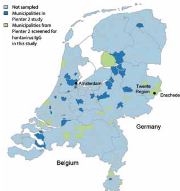
Figure 1. Municipalities sampled in the Pienter 2 study and subset of municipalities included in the seroprevalence study of hantavirus infections, the Netherlands.

we corrected for false-negative results, the overall seroprevalence was 1.7% (95% CI 1.3%–2.3%).