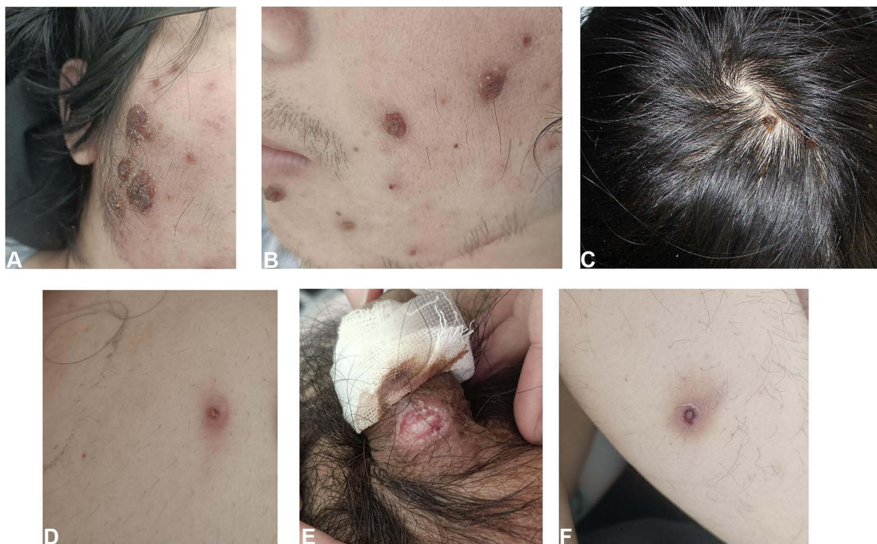
Figure 1 (A–C) multiple erythematous papules/ plaques covered with crust on the scalp and face ranging from 0.5 to 1.5cm. (D) an erythematous papulovesicle on the abdomen. (E) single oval, 1cm-sized, sharply demarcated ulcer located on the penis. (F) an erythematous ulcer on the right calf.