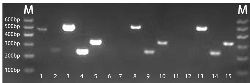
Figure 2 The virulence genes of three isolates. 1–5 represent rmpA2 , iucA , peg-344 , iroB , and rmpA , respectively, from the father's stool sample, and 6–10 represent rmpA2 , iucA , peg-344 , iroB , and rmpA , respectively, from the infant's stool isolate. 11–15 represent rmpA2 , iucA , peg-344 , iroB , and rmpA , respectively, from the infant's CSF isolate. M represents the marker.

The antibiotic susceptibility of K. pneumoniae isolates were determined using the Vitek 2 Compact system (BioMérieux, France) according to Clinical Laboratory Standards Institute guidelines. 8 Details of the antibiotics used for this test are listed in Table 1.