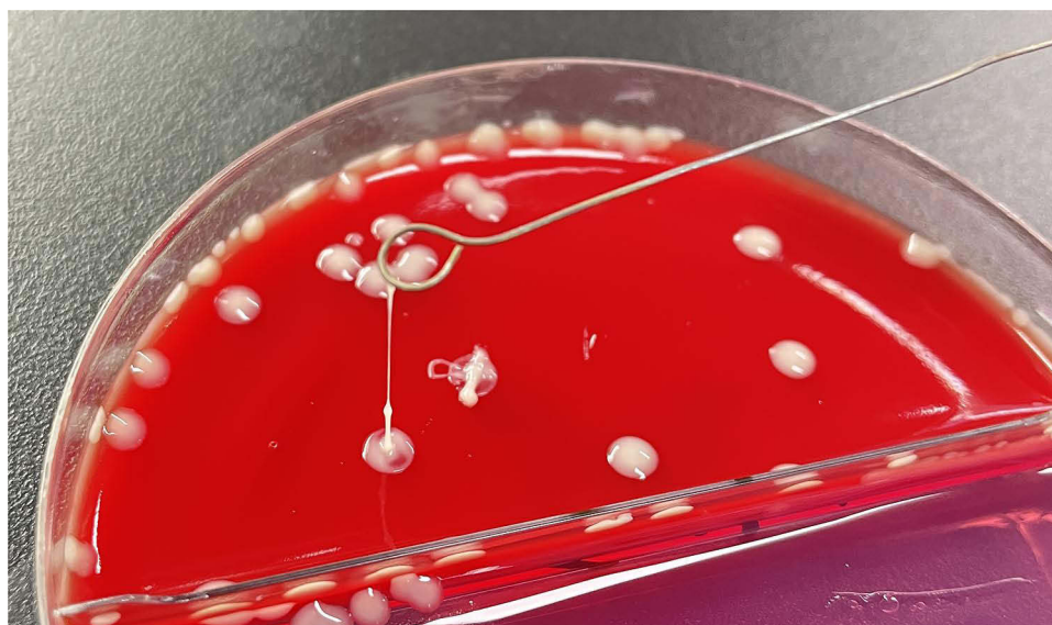
Figure 1 The string test in an isolated colony of Klebsiella pneumoniae from the CSF on an agar plate, which showed hypermucoviscosity with a > 5-mm-long viscous filament.

To trace the origin of the central nervous system infection in the infant, her clinician was questioned, and stool samples from the infant and her parents were cultured. K. pneumoniae was isolated from the stool samples of both the infant and her father, and the string test of these two isolates were both positive. The antimicrobial susceptibility of three isolates from the infant's CSF and stool samples and her father's stool were characterized using the VITEK-2 system. Polymerase chain reaction (PCR) was used to detect five virulence-associated genes, including rmpA , iroB , peg-344 , iucA , and rmpA 2 , from the three isolates. Genetic relatedness was analyzed using capsular typing by PCR and multilocus sequence typing. Antimicrobial susceptibility testing suggested that the three isolates were susceptible to all antibiotics except ampicillin (Table 1). Virulence gene results show that the isolates from the CSF and stool samples from the infant were positive for peg-344 , iroB , and rmpA and negative for rmpA 2 and iucA , whereas the isolate from the father's stool was positive for all the five virulence genes (Figure 2). The three K. pneumoniae isolates were all identified as capsular serotype K2 (Figure 3) and ST86.