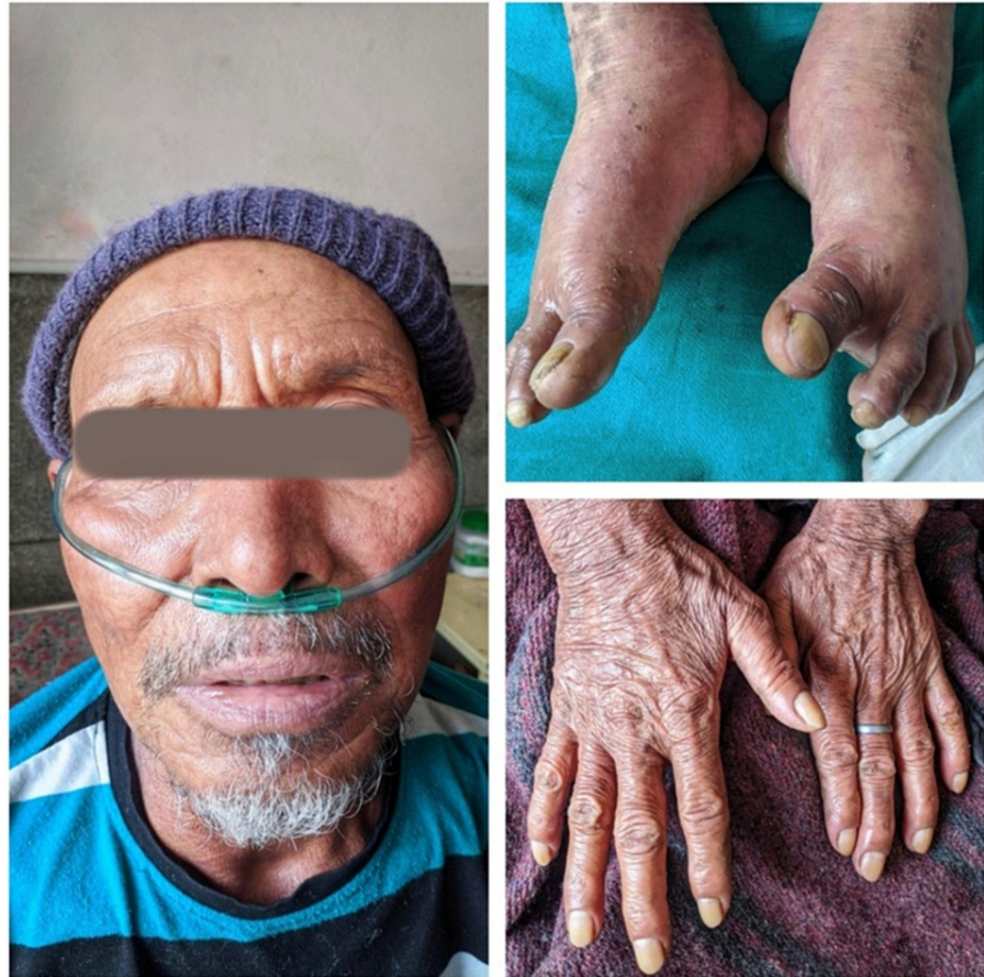
FIGURE 4: Clinical improvement and recovery

A rechallenge of antitubercular medication was done, according to the Philadelphia Tuberculosis Control Program [7]. The medication started initially from 1/4th dose to 2/4th on the first day in the morning and evening, respectively, and 3/4th to complete doses on the second day. Vitals and cutaneous signs were monitored every half an hour throughout the rechallenge process. Due to patient noncompliance and financial constraints, we could not continuously monitor his complete blood count, liver function, and renal function tests.