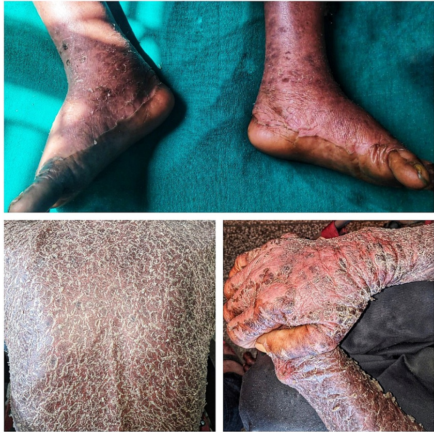
FIGURE 2: Cutaneous manifestation of drug hypersensitivity

At presentation, he had facial and bilateral non-pitting pedal edema (Figures 1-2) and showed respiratory distress with cough.